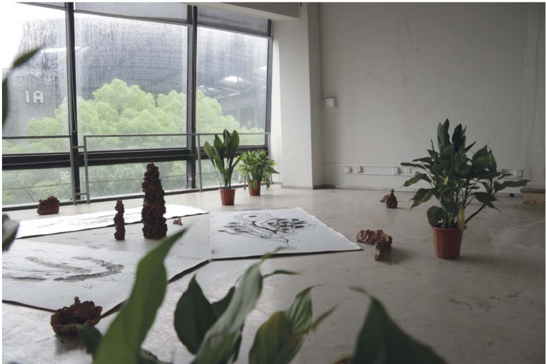
Hangzhou

Zwar ist die Kunstszene in Hangzhou (so wie ich sie erfahren habe) sehr fest mit der Akademie verbunden. Nichtsdestotrotz haben sich dadurch viele wertvolle Kontakte ergeben, die auch jetzt und für meine künftige künstlerische Tätigkeit eine Relevanz spielen nicht nur wenn es um den Austausch untereinander geht, aber auch im Sinne des Erarbeitens gemeinsamer Projekte. Hangzhou ist ein wundervoller Ort, an dem viel passiert. Es ist aber durchaus auch empfehlenswert andere Städte zu besuchen, die Kunstorte dort zu sehen und so seinen Horizont, aber auch die künstlerischen Möglichkeiten auszupendeln. Ich fand Hangzhou auch vor allem im Sinne der für mich relevanten Themen (vgl. oben) fruchtbar; die Auseinandersetzung mit chinesischer Philosophie sowie auch den verschiedenen religiösen Strömungen fand ich sehr bereichernd.