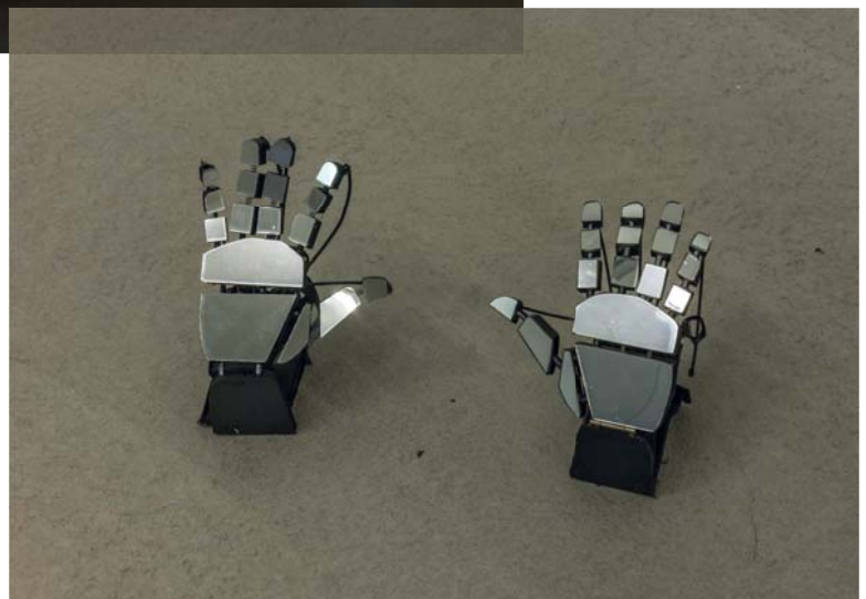
Groupshow © Kathrin Schulthess