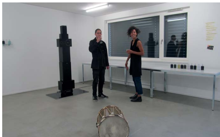
Open Studio © Eikoh Tanaka