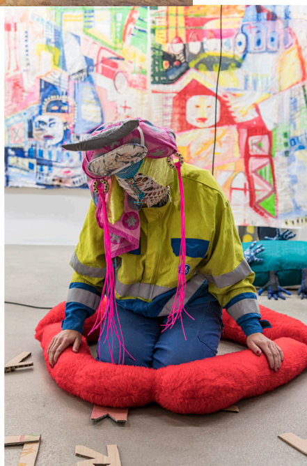
Performance «Some Body*ies» at the opening of Regionale 21