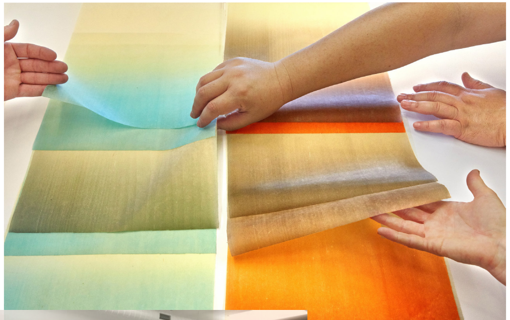
Printing Project «Edition Basel» was our guest at Salon Mondial © Edition Basel