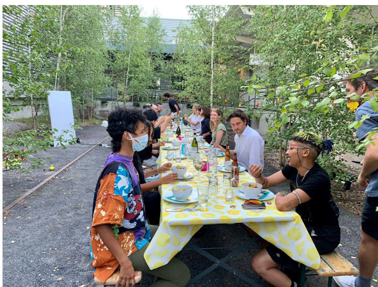
Welcome Diner after the End of the first Lockdown