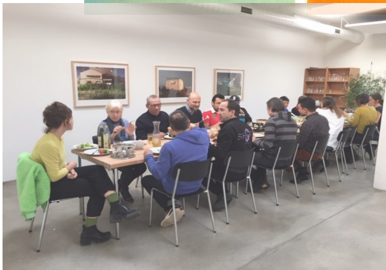
«Meet & Eat», Friday Lunch at Cuisine Mondiale - shortly before the Pandemic arrived in Basel